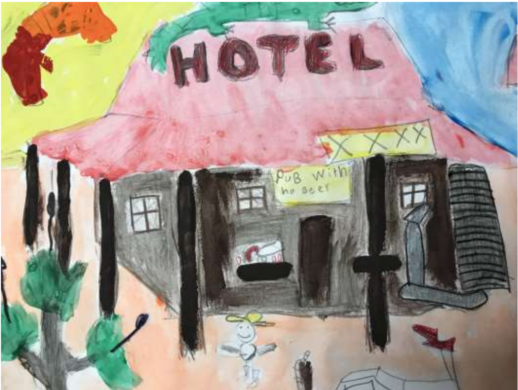
Bentley Yr 1