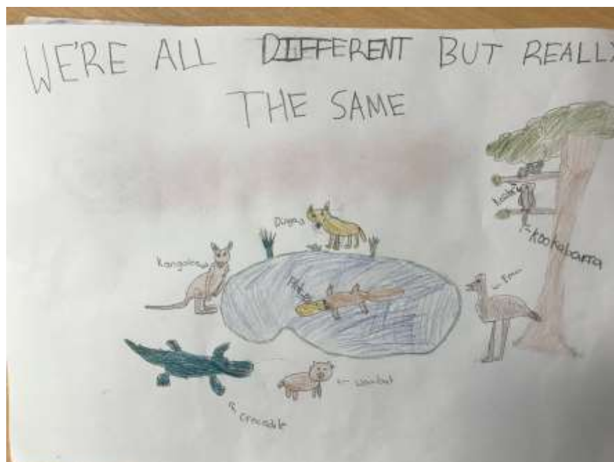
Lani Yr 4