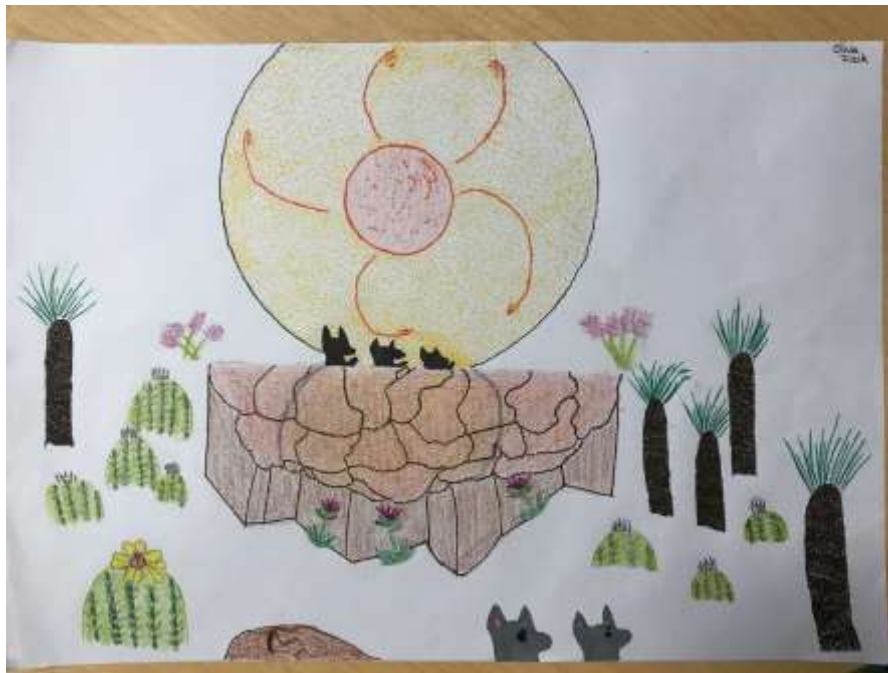
Olivia Yr 4