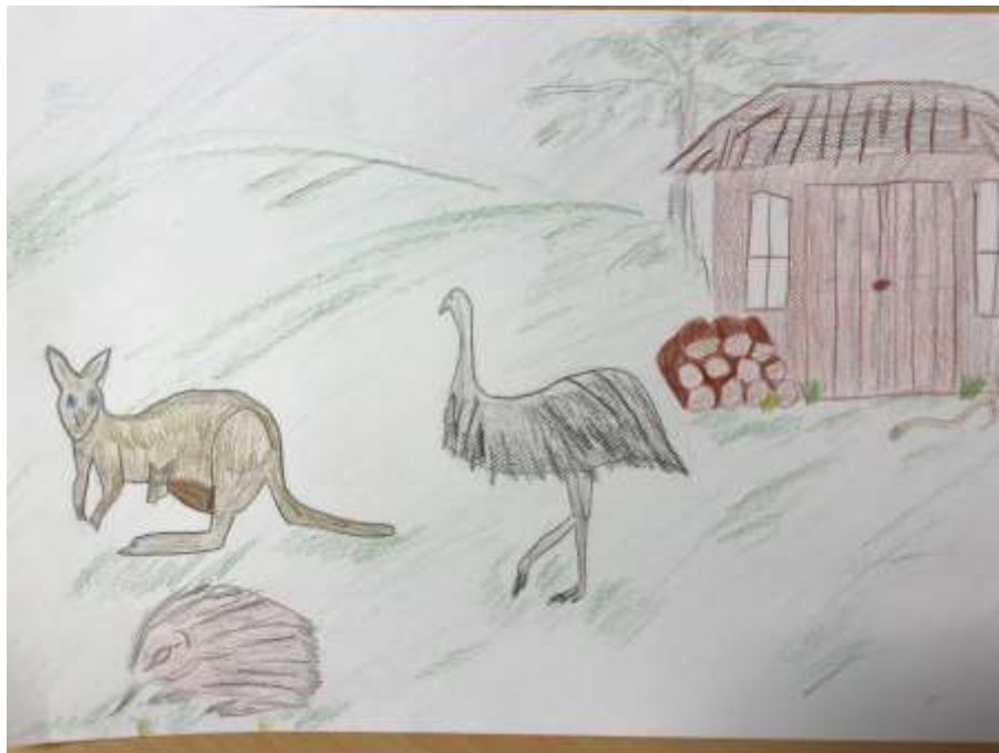
Lexi Yr 4