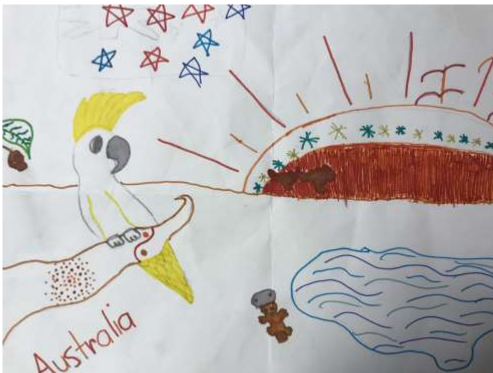
Lily Yr 6