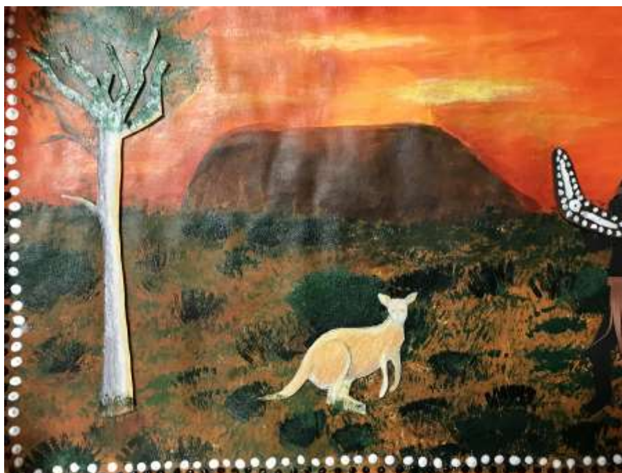
Katie Yr 6