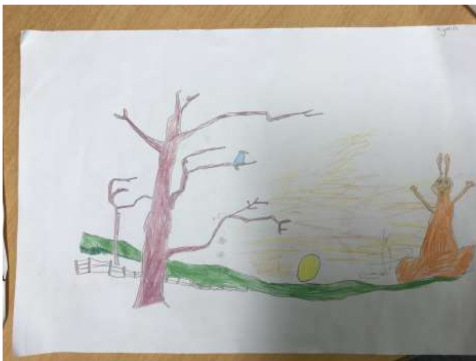
Lydia Yr 2