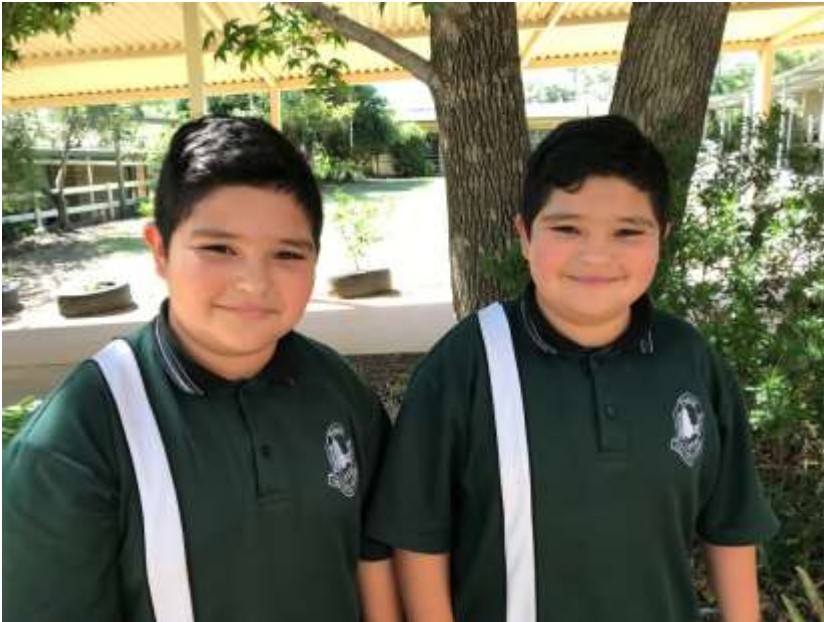
Year 6 Fundraising Co-Ordinators